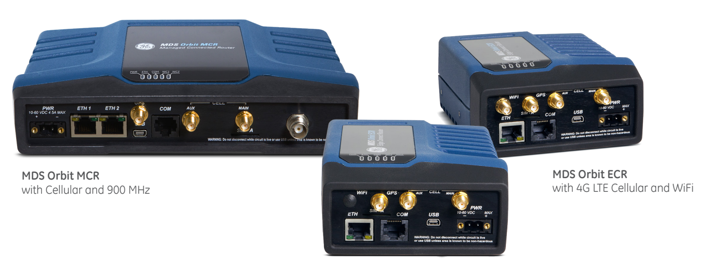
MDS Orbit ECR with 4G LTE Cellular

An easy-to-use Graphical User Interface (GUI) allows for the quick provisioning and maintenance from a web browser. MDS Orbit's wizards accelerate the configuration of complex network functionality by breaking down processes into simple, concise and automated steps.